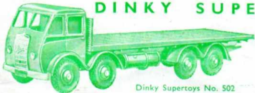
Dinky Supertoys No. 502