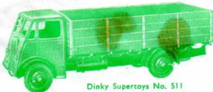
Dinky Supertoys No. 511

Dinky Supertoys are models of outstanding quality, similar in style to Dinky Toys but much larger. The Foden Wagon is 7½ in. long and the Guy Lorry 5½ in. long. The great amount of accurate detail included gives the models a strikingly realistic appearance.