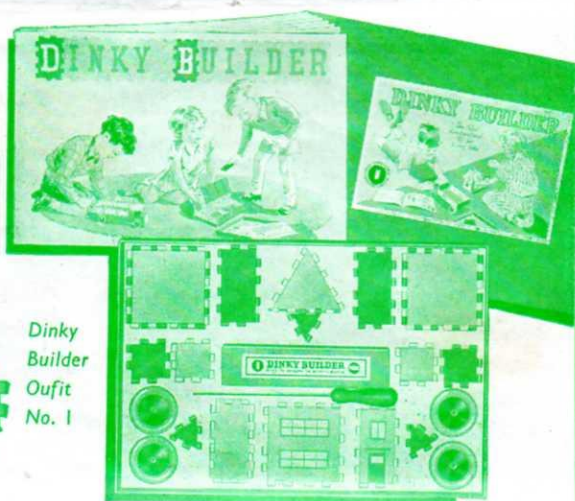
Dinky Builder Outfit No. 1

Simplicity is the keynote of this fascinating building system. With Dinky Builder hinged plates and rods, the youngest children can build all kinds of models with the greatest ease—Lorries, Furniture, Buildings, Wheel Toys, Windmills and scores of others.