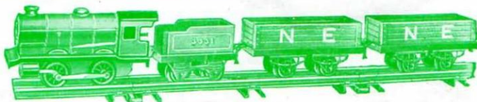
Hornby M1 Goods Train Set.

A few of the famous Hornby Gauge "O" Clockwork Train Sets are again available. Each is complete with rails, and attractively boxed.