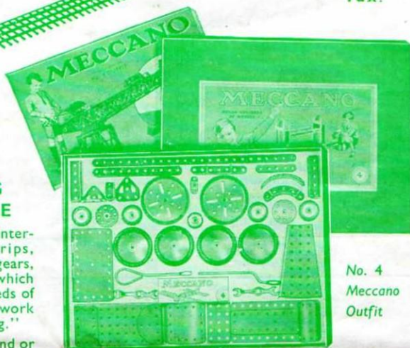
No. 4 Meccano Outfit

Every Outfit includes a good selection of Meccano Parts, with a Screwdriver, a Spanner and a Book of Instructions showing many examples of models that can be built.