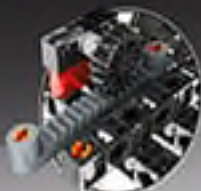
REAR AND FRONT STEERING